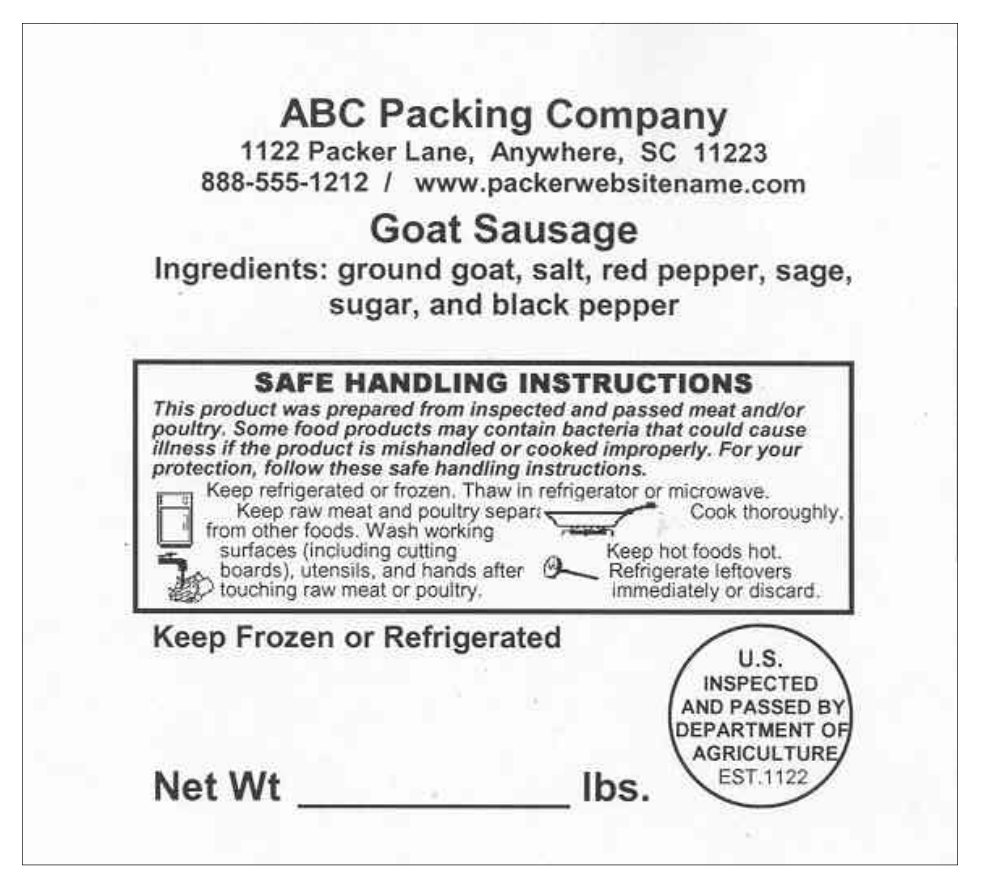
Generic packing label for goat sausage with ingredients listed.

No. Once the meat has left the inspected processing facility, you may not further process it. This includes curing ham or bacon, making sausage, or handling the meats in any way other than storing it and selling it in its original packaging.