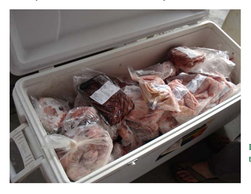
Left: Cooler of meats ready to travel to the farmers market.

Most farmers transport their frozen meats in chest coolers. Again alternative refrigeration such as ice packs, etc. are highly recommended. The chest coolers must be clean along with the transport vehicle. The inspector at the slaughtering facility may inspect the transport vehicle and chest coolers. Unacceptable findings could result in the inspector not allowing the inspected product to be loaded. The chest coolers are inexpensive and can keep the meats frozen until you are able to store them in your on-farm or off-farm freezer space provided you do not encounter any unforeseen problems during transport such as a vehicle breakdown or an accident. Again, another reason for alternative refrigeration. Some farmers use small chest freezers they can power through their car battery. This alternative is more expensive than chest coolers, and may not be necessary for most trips from the processor. Some farmers use small chest type freezers that are plugged in overnight where temperatures are consistently maintained at zero degrees or below. The farmers unplug the freezer and in turn pick up their meat products from the inspected facility. The freezer is already cold and maintains better temperature control than the chest coolers.